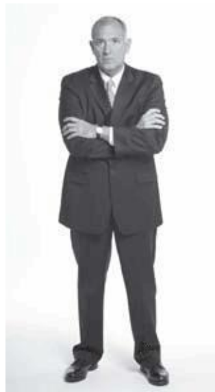
Fig. 32 A sudden crossing of the arms during a conversation could indicate discomfort.

When it is impractical or socially unacceptable to lean away from someone or something we dislike, we often subconsciously use our arms or objects to act as barriers (see figure 32). Clothing or nearby objects (see box 21) also serve the same purpose. For instance, a businessmen may suddenly decide to button his jacket when talking to someone with whom he is uncomfortable, only to undo the jacket as soon as the conversation is over.