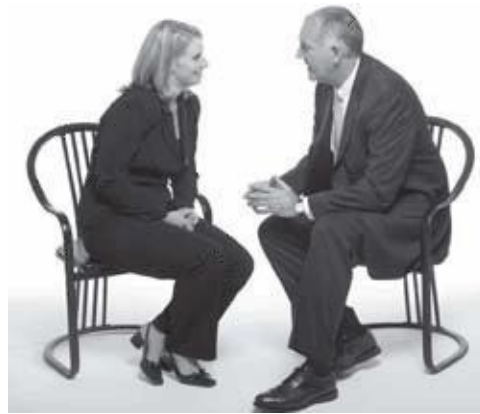
Fig. 30 People lean toward each other when there is high comfort and agreement. This mirroring or isopraxis starts when we are babies.

Not only can we use this information to read the body language of others, but we must also always remember that we are projecting our own nonverbals. During conversations or meetings, as information and opinions flow, our feelings about the news and viewpoints also will flow and be reflected in our ever-changing nonverbal behaviors. If we hear something distasteful one minute and something favorable the next, our bodies will reflect this shift in our feelings.