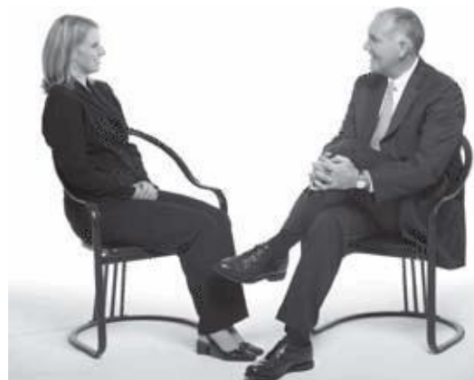
Fig. 25 In this photo the man has positioned his leg so that the knee is further away, removing barriers between himself and the woman.