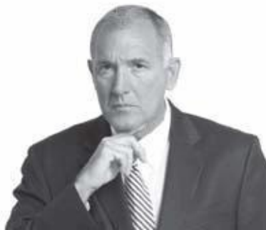
Fig. 15 Even a brief touch of the neck will serve to assuage anxiety or discomfort. Neck touching or massaging is a powerful and universal stress reliever and pacifier.

elbow with her left hand. When the stressful situation is over or there is an intermission in the uncomfortable part of the discussion, her right hand will lower and relax across her folded left arm. If the situation again becomes tense, her right hand will rise, once again, to the suprasternal notch. From a distance, the arm movement looks like the needle on a stress meter, moving from resting (on the arm) to the neck (upright) and back again, according to the level of stress experienced.