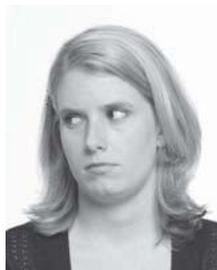
Fig. 71 We look askance at people when we are distrustful or unconvinced, as in this photo.

Looking askance at others is a behavior that is performed with the head and eyes (see figure 71). It can take the form of a sideways or tilted head motion accompanied by a side glance or a brief roll of the eyes. Looking askance is a display that is seen when we are suspicious of others or question the validity of what they are saying. Sometimes this body signal is very quick; at other times it may be almost sarcastically exaggerated and last throughout an encounter. While more curious or wary than clearly disrespectful, this nonverbal is fairly easy to spot and its message is, “I am listening to you but I am not buying what you’re saying—at least not yet.”