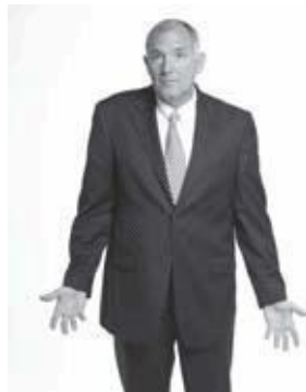
Fig. 36 Partial shoulder shrugs indicate lack of commitment or insecurity.

Full and slight shoulder shrugs can mean a lot in context. When the boss asks an employee, "Do you know anything about this customer's complaint?" and the employee answers, "No," while giving a half shrug, chances are the speaker is not committed to what was just said. An honest and true response will cause both shoulders to rise sharply and equally. Expect people to give full (high) shoulder shrugs when they confidently support what they are saying. There is nothing wrong with saying, "I don't know!" while both shoulders rise up toward the ear. As discussed previously, this is a gravity-defying behavior that normally signifies the person is comfortable and confident with his or her actions. If you see a person's shoulders only partially rise or if only one shoulder rises, chances are the individual is not limbically committed to what he or she is saying and is probably being evasive or even deceptive (see figures 36 and 37).