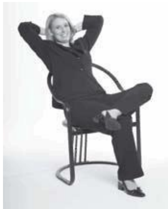
Fig. 43 Interlaced hands behind the head are indicative of comfort and dominance. Usually the senior person at a meeting will pose or “hood” this way.

Another territorial display—similar to arms akimbo—can often be seen during business meetings and other seated social encounters when a person leans back and interlaces his hands behind his head (see figure 43). I spoke to a cultural anthropologist about this behavior, and we both concluded that it is reminiscent of the way in which a cobra “hoods” to alert other animals of his dominance and power. This hooding effect makes us larger than life and tells others, “I am in charge here.” There is also a pecking order to this and other dominance displays. For instance, while waiting for a meeting to begin, the office supervisor may assume the interlaced hands-behind-the-head-elbows-out display. However, when the boss comes into the room, this territorial hooding display will stop. Claiming territory is for those of high status or those in charge. Thus it is the boss’s right to assume this behavior while everyone else will be expected to bring their hands down to the table in an appropriate show of deference.