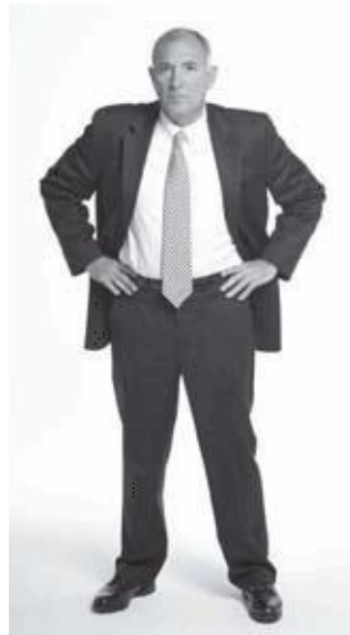
Fig. 40 Arms akimbo is a powerful territorial display that can be used

For women, arms, akimbo may have particular utility. I have taught women executives that it is a powerful nonverbal display that they can employ when confronting males in the boardroom. It is an effective way for anyone, especially a woman, to demonstrate that she is standing her ground, confident, and unwilling to be bullied. Too often young women enter the workplace and are bullied nonverbally by males who insist on talking to them with arms akimbo in a show of territorial dominance (see figure 41). Aping this behavior—or using it first—can serve to level the playing field for women who may be reluctant to be assertive in other ways. Arms akimbo is a good way of saying that there are “issues,” “things are not good,” or “I am standing my ground” in a territorial display (Morris, 1985, 195).