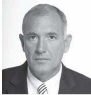
Fig. 1 Note features of face when not stressed. Eyes are relaxed and the lips should be full.