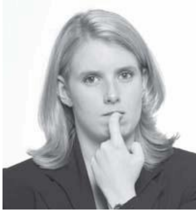
Fig. 48 Nail-biting is generally perceived as a sign of insecurity or nervousness.