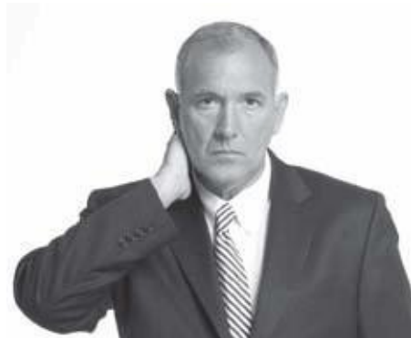
Fig. 9 Neck touching takes place when there is emotional discomfort, doubt, or insecurity.