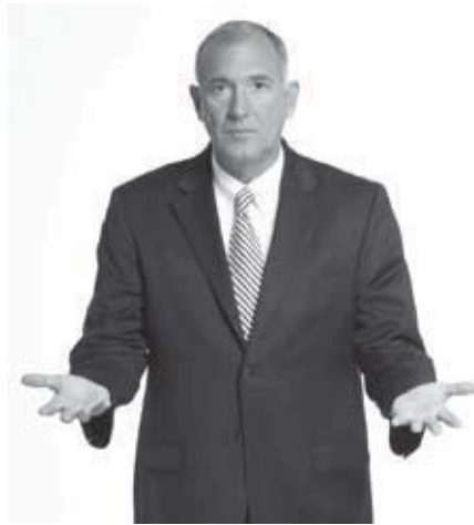
Fig. 89 The palms-up or “rogatory” position usually indicates the person wants to be believed or wants to be accepted. It is not a dominant, confident display.

When a person places his outstretched arms in front of his body, with palms up, this is known as the rogatory (or “prayerful”) display (see figure 89). Those who worship will turn their palms up to God to ask for mercy. Likewise, captured soldiers will turn up their palms as they approach their captors. This behavior is also seen in individuals who say something when they want you to believe them. During a discussion, observe the person with whom you are speaking. When she makes a declarative statement, note whether her hands are palm up or palm down. During regular conversation in which ideas are being discussed and neither party is vehemently committed to a particular point, I expect to see both palm-up and palm-down displays.