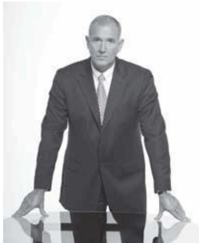
Fig. 90 Statements made palm down are more emphatic and more confident than statements made with hands palm up in the rogatory position.

The palm-up position is not very affirmative and suggests that the person is asking to be believed. The truthful don't have to plead to be believed; they make a statement and it stands.