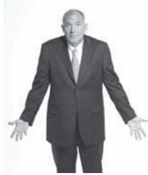
Fig. 37 We use shoulder shrugs to indicate lack of knowledge or doubt. Look for both shoulders to rise; when only one side rises, the message is dubious.