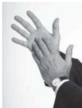
Fig. 57 We often pacify anxiety or nervousness by stroking our fingers across the palm or rubbing our hands together.

A person who is in doubt (a lesser degree of lowered confidence) or under low stress will only slightly rub the palms of his hands together (see figure 57). However, if the situation becomes more stressful or if his confidence level continues to fall, watch how suddenly gentle finger-to-palm stroking transitions to more dramatic rubbing of interlaced fingers (see figure 58). The interlacing of fingers is a very accurate indicator of high distress that I have seen in the most acute of interviews—both in the FBI and in people testifying before Congress. As soon as an extremely delicate subject comes up, the fingers straighten and intertwine, as the hands FPO text: #58 begin to rub up and down. I speculate that the increased tactile contact between the hands provides the brain with more pacifying messages.