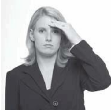
Fig. 8 Rubbing of the forehead is usually a good indicator that a person is struggling with something or is undergoing slight to severe discomfort.