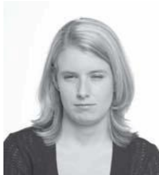
Fig. 62 We squint to block out light or objectionable things. We squint when we are angry or even when we hear voices, sounds, or music we don't like.