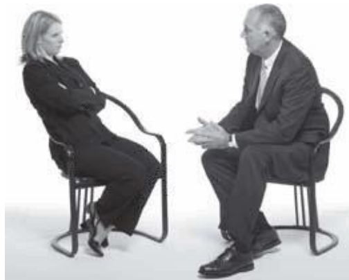
Fig. 31 We lean away from things and people we don't like, even from colleagues when they say things with which we don't agree.

A very powerful way to let others know that you agree with them, or are consciously contemplating what they are saying, is to lean toward them or to ventrally front them. This tactic is especially effective when you are in a meeting and you don't have the opportunity to speak up.