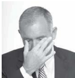
Fig. 6 Eye blocking is a very powerful display of consternation,

The fight response is the limbic brain's final tactic for survival through aggression. When a person confronting danger cannot avoid detection by freezing and cannot save himself by distancing or escaping (flight), the only alternative left is to fight. In our evolution as a species, we—along with other mammals—developed the strategy of turning fear into rage in order to fight off attackers (Panksepp, 1998, 208). In the modern world, however, acting on our rage may not be practical or even legal, so the limbic brain has developed other strategies beyond the more primitive physical fight response.