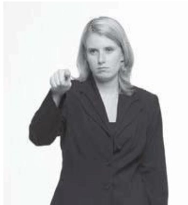
Fig. 46 Perhaps one of the most offensive gestures we possess is finger pointing. It has negative connotations around the globe.

saying things like “I know you did it.” The finger pointing is so distasteful that it may actually divert the child’s attention from what is being said as they process the hostile message of the gesture (see box 38).