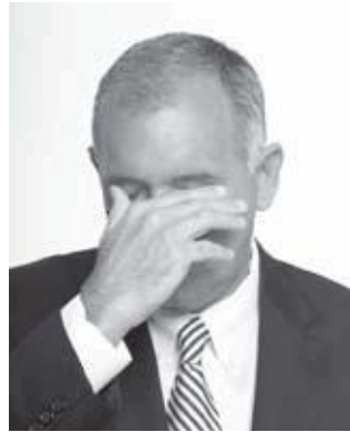
Fig. 64 Eye blocking with the hands is an effective way of saying, “I don’t like what I just heard, saw, or learned.”

respice or to communicate our deepest sentiments, but regardless of the reason, the brain still compels us to perform this behavior.