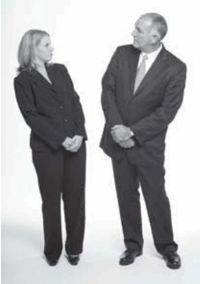
Fig. 5 People lean away from each other subconsciously when they disagree or feel uncomfortable around each other.