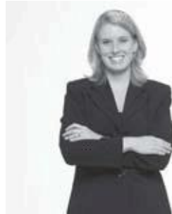
Fig. 33 In public, many of us comfortably cross our arms while waiting or listening to a speaker. Around the house we rarely sit this way unless something is bothering us, like waiting for a late ride.

initially will sit with their arms crossed, and then loosen them over time. Obviously, something happens to elicit this behavior; probably greater comfort with their surroundings and their instructor.