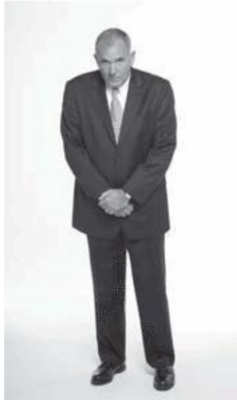
Fig. 4 The “turtle effect” (shoulders rise toward the ears) is often seen when people are humbled or suddenly lose confidence.

Interestingly and sadly, abused children often manifest these freezing limbic behaviors. In the presence of an abusive parent or adult, their arms will go dormant at their sides and they avoid eye contact as though that helps them not to be seen. In a way, they are hiding in the open, which is a tool of survival for these helpless kids.