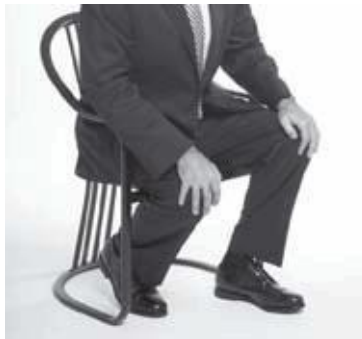
Fig. 19 Claspings of the knees and shifting of weight on the feet is an intention cue that the person wants to get up and leave.

There are other examples of intention movements of the legs that are associated with an individual who wants to leave his current location. Take note if a person who is sitting down places both hands on his knees in a knee clasp (see figure 19). This is a very clear sign that in his mind, he is ready to conclude the meeting and take leave. Usually this hands-on-knees gesture is followed by a forward lean of the torso and/or a shift of the lower body to the edge of the chair, both intention movements. When you note these cues, particularly when they come from your superiors, it's time to end your interaction; be astute and don't linger.