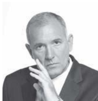
Fig. 10 Cheek or face touching is a way to pacify when nervous, irritated, or concerned.