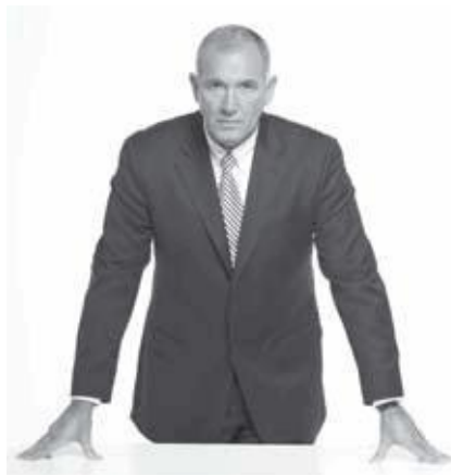
Fig. 44 Fingertips planted spread apart on a surface are a significant territorial display of confidence and authority.