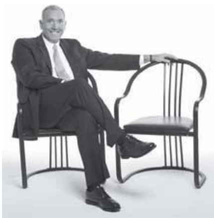
Fig. 45 Arms spread out over chairs tell the world you are feeling confident and comfortable.