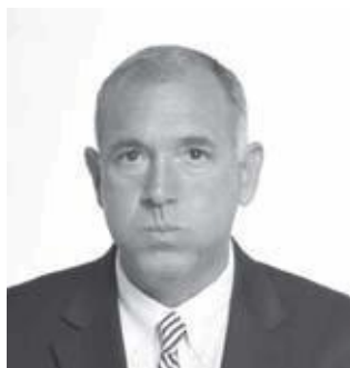
Fig. 11 Exhaling with puffed out cheeks is a great way to release stress and to pacify. Notice how often people do this after a near mishap.

For our purposes, any touching of the face, head, neck, shoulder, arm, hand, or leg in response to a negative stimulus (e.g., a difficult question, an embarrassing situation, or stress as a result of something heard, seen, or thought) is a pacifying behavior. These stroking behaviors don't help us to solve problems; rather, they help us to remain calm while we do. In other words, they soothe us. Men prefer to touch their faces. Women prefer to touch their necks, clothing, jewelry, arms, and hair.