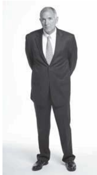
Fig. 39 Sometimes called the “regal stance,” arms behind the back mean “don’t draw near.” You see royalty using this behavior to keep people at a distance.

imitated and transmitted to the next generation.