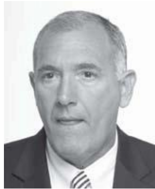
Fig. 81 Lip licking is a pacifying behavior that tends to soothe and calm us down. You see it in class just before a test.

Tongue-jutting behavior is a gesture used by people who think they have gotten away with something or are caught doing something. I have seen this behavior in flea markets both here and in Russia, among street vendors in Lower Manhattan, at poker tables in Las Vegas, during interviews at the FBI, and in business meetings. In each case, the person made the gesture—tongue between the teeth without touching the lips—at the conclusion of some sort of a deal or as a final nonverbal statement (see figure 82). This, in its own way, is a transactional behavior. It seems to present subconsciously at the end of social interactions and has a variety of meanings that must be taken in context. Its several meanings include: I got caught, gleeful excitement, I got away with something, I did something foolish, or I am naughty.