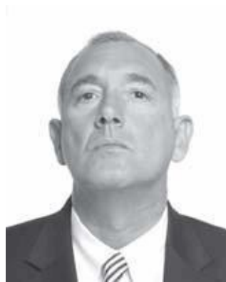
Fig. 86 When we feel positive, the chin comes out and the nose is high: both signs of comfort and confidence.

In Europe, in particular, you see a lot more of these behaviors, especially holding the nose high when looking down on those of lower class or snubbing someone. I was watching French television while traveling abroad and noted how one politician, when asked a question he deemed beneath him, merely raised his nose high, looking down on the reporter, and answered “No, I will not answer that.” The nose reflected his status and attitude of contempt for the reporter. Charles de Gaulle, a rather complex individual who eventually became the president of France, was famous for projecting this kind of haughty attitude and image.