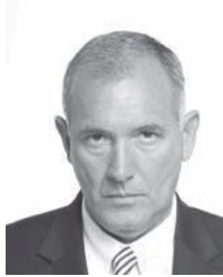
Fig. 85 When confidence is low or we are concerned for ourselves, the chin will tuck in, forcing the nose down.