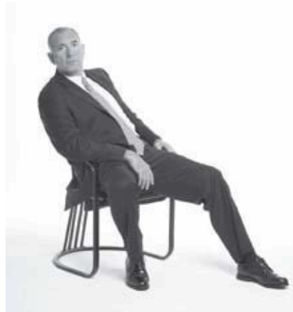
Fig. 35 Splaying out is a territorial display, which is OK in your own home but not in the work place, especially during a job interview.

response to your spatial “invasion,” which will cause him or her to sit up. If you allow your child to get away with torso splays during major disagreements, don’t be surprised if he or she loses respect for you over time. And why not? By allowing such displays, you are basically saying, “It’s OK to disrespect me.” When these kids grow up, they may continue to splay out inappropriately in the workplace when they should be sitting up attentively. This is not conducive to longevity on the job, since it sends a strong negative nonverbal message of disrespect for authority.