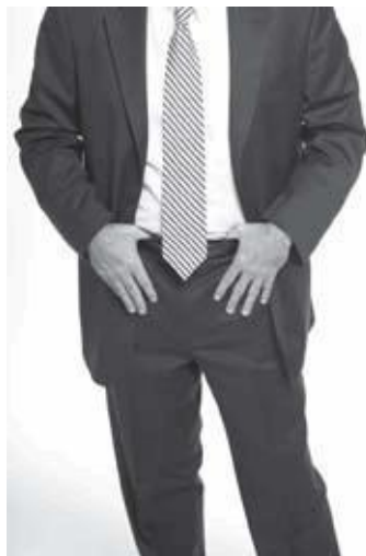
Fig. 56 Using the hands to frame the genitals is often seen with young males and females during the courtship years. It is a dominance display.

Not long after starting to write this book, I discussed this nonverbal behavior when teaching a class at the FBI in Quantico, Virginia. The students scoffed, saying that no man, especially subconsciously, would be that blatant about his sexuality. The very next day, one of the students came back and told the class that he had observed a student in the bathroom who stood in front of the mirror, preened himself, put on his sunglasses, and just for a moment did some genital framing before he proudly exited the bathroom. I am sure that the guy wasn't even thinking about what he was doing. But in fact, genital framing occurs more often than we think, and not only in country western videos! Remember the Fonz in the TV series Happy Days ?