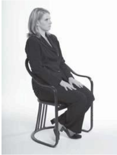
Fig. 28 A sudden interlocking of the legs may suggest discomfort or insecurity. When people are comfortable, they tend to unlock their ankles.

When an individual suddenly turns his toes inward or interlocks his feet, it is a sign that he is insecure, anxious, and/or feels threatened. When interviewing suspects in crimes, I often notice that they interlock their feet and ankles when they are under stress. A lot of people, especially women, have been taught to sit this way, especially when wearing a skirt (see figure 28). However, to lock the ankles in this way, especially over a prolonged period, is unnatural and should be considered suspect, particularly when done by males.