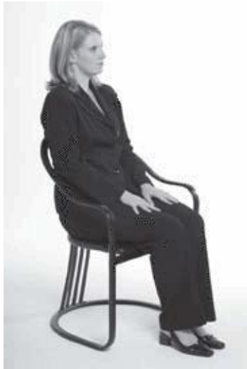
Fig. 16 When stressed or nervous, people will “cleanse” their palms on their laps in order to pacify themselves. Often missed under tables, it is a very accurate indicator of discomfort or anxiety.

In my experience, I find the leg cleanser to be very significant because it occurs so quickly in reaction to a negative event. I have observed this action for years in cases when suspects are presented with damning evidence, such as pictures of a crime scene with which they are already familiar (guilty knowledge). This cleansing/pacifying behavior accomplishes two things at once. It dries sweaty palms and pacifies through tactile stroking. You can also see it when a seated couple is bothered or interrupted by an unwelcome intruder, or when someone is struggling to remember a name.