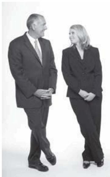
Fig. 23 When two people are talking and both have crossed their legs, this is an indication that they are very comfortable around each other.

one of the women suddenly crossed her legs so that she was on one foot leaning toward her friend. I commented, “You ladies must have known each other for a long time.” Their eyes and faces lit up, and one asked how I knew this. I said, “Even though you were meeting me—a stranger—for the first time, one of you crossed your legs to favor the other. That is very unusual unless you really like and trust each other.” They both giggled and one inquired, “Can you read minds, too?” To which I laughed and answered, “No.” After I had explained what gave their long-term friendship away, one of the two women confirmed they had known each other since they were in grade school in Cuba in the forties. Once again, the leg cross proved to be an accurate barometer of human sentiments.