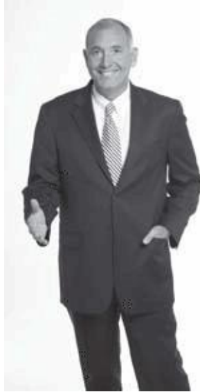
Fig. 51 Often seen with high-status individuals, the thumb sticking out of the pocket is a high-confidence display.