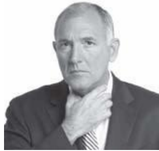
Fig. 14 Men typically cover their necks more robustly than women as a way to deal with discomfort or insecurity.

Over the decades that I have studied nonverbal behaviors, I have observed that there are gender differences in the way men and women use the neck to pacify themselves. Typically, men are more robust in their pacifying behaviors, grasping or cupping their necks just beneath the chin with their hands, thereby stimulating the nerves (specifically, the vagus nerves or the carotid sinus) of the neck, which in turn slow the heart rate down and have a calming effect. Sometimes men will stroke the sides or the back of the neck with their fingers, or adjust their tie knot or shirt collar (see figure 15).