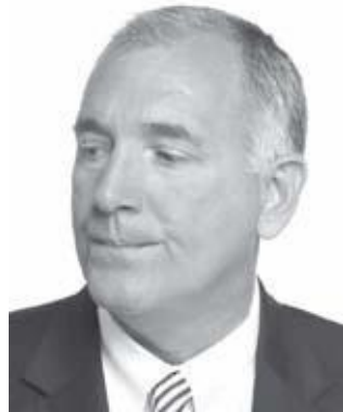
Fig. 80 A sneer fleetingly signifies disrespect or disdain. It says “I care little for you or your thoughts.”

The sneer, like the rolling of the eyes, is a universal act of contempt. It is disrespectful and reflects a lack of caring or empathy on the part of the person doing the sneering. When we sneer, the buccinator muscles (on the sides of our face) contract to draw the lip corners sideward toward the ears and produce a sneering dimple in the cheeks. This expression is very visible and meaningful even if it is flashed for just a moment (see figure 80). A sneer can be very illuminating with regard to what is going on in a person’s mind and what that may portend (see box 54).