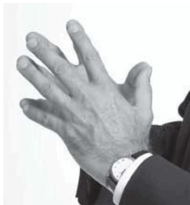
Fig. 49 Steeping of hands, fingertip to fingertip, is one of the most powerful displays of confidence we possess.

Steepling signifies that you are confident of your thoughts or position. It lets others know precisely how you feel about something and how dedicated you are to your point of view (see box 40). High-status people (lawyers, judges, medical doctors) often use steeping as part of their daily behavioral repertoire because of their confidence in themselves and their status. All of us have steeped at one time or another, but we do so to varying degrees and using a variety of styles. Some do it all the time; some rarely do it; others perform modified steeples (such as with only the extended index finger and thumb touching each other while remaining fingers are interlaced). Some steeple under the table; others do it high in front of them; some even steeple above their heads.