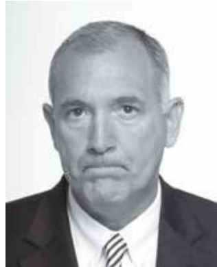
Fig. 78 When the lips disappear and the corners of the mouth turn down, emotions and confidence are at a low point, while anxiety, stress, and concerns are running high.

Fig. 77 Lip compression, reflecting stress or anxiety, may progress to the point where the lips disappear, as in this photo.