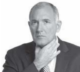
Fig. 13 Men tend to massage or stroke their necks to pacify distress. This area is rich with nerves, including the vagus nerve, which when massaged will slow down the heart rate.

Neck touching and/or stroking is one of the most significant and frequent pacifying behaviors we use in responding to stress. One person may rub or massage the back of his neck with his fingers; another may stroke the sides of his neck or just under the chin above the Adam’s apple, tugging at the fleshy area of the neck. This area is rich with nerve endings that, when stroked, reduce blood pressure, lower the heart rate, and calm the individual down (see figures 13 and 14).