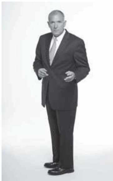
Fig. 26 When a person talks to you with feet pointed away, it is a good indication this person wants to be elsewhere. Watch for people who make formal declarations in this position, as this is a form of distancing.

Over the years, I have conducted training for customs inspectors in the United States and abroad. I have learned an incredible amount from them, and I hope they have picked up a few pointers from me. One thing I have taught them is to look for passengers who point their feet toward the exit while turning to the officer to make their customs declaration (see figure 26). While they could simply be in a hurry to catch a flight, this behavior should make the inspector suspicious. In studies, we found that people who make affirmative declarations such as “I have nothing to declare, officer,” but have their feet turned away are more likely to be concealing something they should have declared. In essence, their faces are obliging, their words are definitive, but their feet reveal they are being less than cooperative.