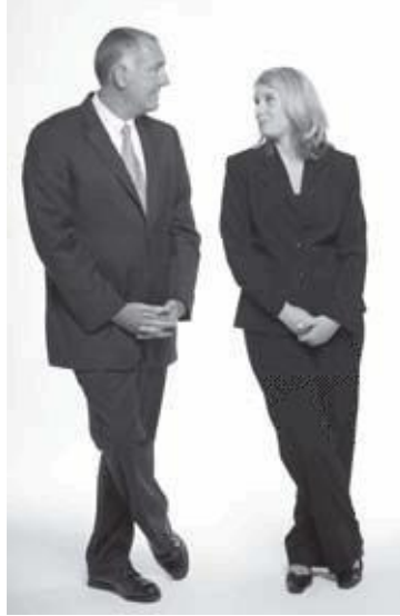
Fig. 87 Here is an example of isopraxis: Both people are mirroring each other and leaning toward each other, showing signs of high comfort.

If you are relaxed and poised during a conversation or interview, while the other party continually looks at the clock or sits in a way that is tense or lacks movement (referred to as flash frozen ), this is suggestive that there is no comfort, even though to the untrained eye it may appear that everything is all right (Knapp & Hall, 2002, 321; Schafer & Navarro, 2004, 66). If the other person seeks disruptions or talks repeatedly of finalizing the conversation, these too are signs of discomfort.