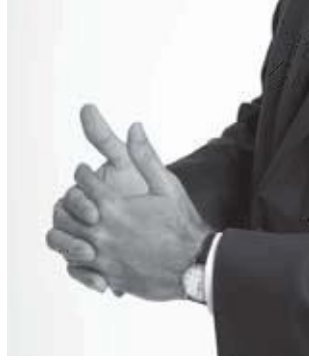
Fig. 52 Thumbs up is usually a good indication of positive thoughts. This can be very fluid during a conversation.