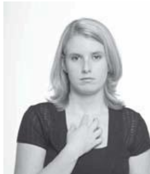
Fig. 7 Covering of the neck dimple pacifies insecurities, emotional discomfort, fear, or concerns in real time. Playing with a necklace often serves the same purpose.

Pacifying behaviors take many forms. When stressed, we might soothe our necks with a gentle massage, stroke our faces, or play with our hair. This is done automatically. Our brains send out the message, “Please pacify me now,” and our hands respond immediately, providing an action that will help make us comfortable again. Sometimes we pacify by rubbing our cheeks or our lips from the inside with our tongues, or we exhale slowly with puffed cheeks to calm ourselves (see figures 10 and 11). If a stressed person is a smoker, he or she will smoke more; if the person chews gum, he or she will chew faster. All these pacifying behaviors satisfy the same requirement of the brain; that is, the brain requires the body to do something that will stimulate nerve endings, releasing calming endorphins in the brain, so that the brain can be soothed (Panksepp, 1998, 272).