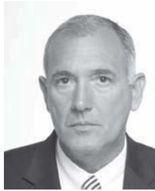
Fig. 75 Note that when the lips are full, usually the person is content.

point of view, you should monitor the ongoing conversation long enough to gather additional clues.