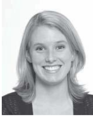
Fig. 68 When we are content, our eyes are relaxed and show little tension.