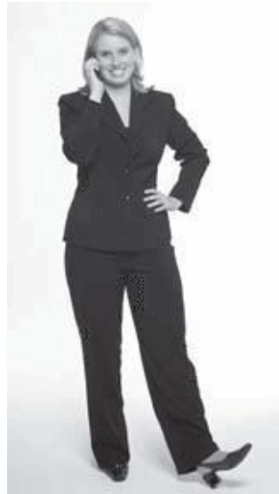
Fig 20 When the toes point upward as in this photograph, it usually means the person is in a good mood or is thinking or hearing something positive. Fig. 20

Even when standing still, a person telling a story may inch up to a taller stance, elevating himself to emphasize his points, and he may do so repeatedly. The individual does this subconsciously; therefore these elevating behaviors are very honest cues, since they tend to be true expressions of the emotion attached to the story. They appear in real time along with the story line and relate his feelings along with his words. Just as we move our feet to the beat and tempo of a song we like, so too will we move our feet and legs in congruence with something positive we say.