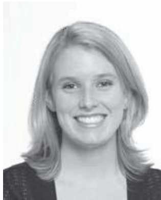
Fig. 69 Here the eyebrows are arched slightly, defying gravity, a sure sign of positive feelings.