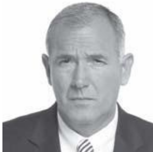
Fig. 2 A stressed face is tense and slightly contorted, eyebrows are knitted, and the forehead is furrowed.

Commandment 6: Always try to watch people for multiple tells—behaviors that occur in clusters or in succession. Your accuracy in reading people will be enhanced when you observe multiple tells , or clusters of behavior body signals on which to rely. These signals work together like the parts of a jigsaw puzzle. The more pieces of the puzzle you possess, the better your chances of putting them all together and seeing the picture they portray. To illustrate, if I see a business competitor display a pattern of stress behaviors, followed closely by pacifying behaviors, I can be more confident that she is bargaining from a position of weakness.