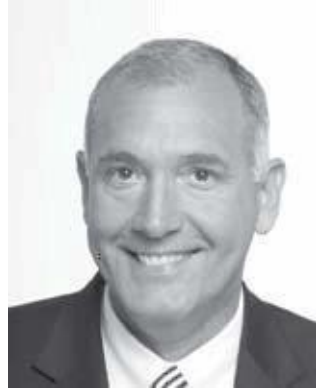
Fig. 72 A real smile forces the corners of the mouth up toward the eyes.

and even your boss. It provides information about people's feelings in all types and phases of interpersonal interaction.