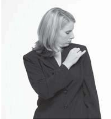
Fig. 47 Self-preening is acceptable, but not when others are talking to you. This is a sign of dismissiveness.