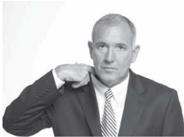
Fig. 17 Ventilating of the neck area relieves stress and emotional discomfort. Rodney Dangerfield, the comedian, was famous for doing this when he wasn't getting any "respect."

their arms and rubbing their hands against their shoulders, as if experiencing a chill. Watching a person employ this pacifying behavior is reminiscent of the way a mother hugs a young child. It is a protective and calming action we adopt to pacify ourselves when we want to feel safe. However, if you see a person with his arms crossed in front, leaning forward, and giving you a defiant look, this is not a pacifying behavior!