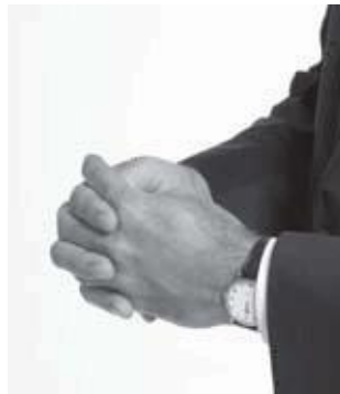
Fig. 53 The thumbs can suddenly disappear, as in this photo, when there is less emphasis or emotions turn negative.