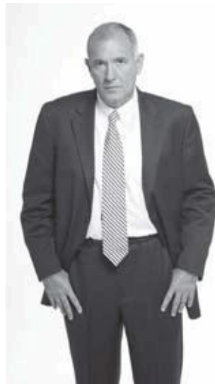
Fig. 55 Often used as a sign of insecurity or social discomfort, thumbs in the pocket transmit this message readily and thus should be avoided.

Try this experiment on your own. Stand with your thumbs in your pockets and ask people what they think of you. Their comments will confirm the unflattering and weak attitude this posture projects. You will never see a presidential candidate or a leader of a country with his thumbs in his pockets. This behavior is not seen in confident individuals (see figure 55).