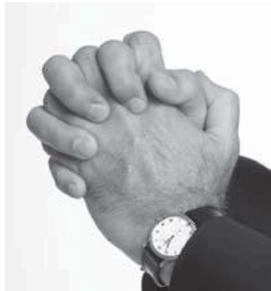
Fig. 50 Hand-wringing is a universal way of showing we are stressed or concerned.

changing events. A person can go from steepling (high confidence) to fingers interlaced (low confidence) and back to steepling (high confidence)—reflecting the ebb and flow of assurance and doubt.