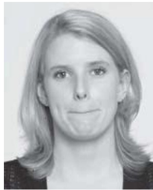
Fig. 74 When the lips disappear, there is usually stress or anxiety driving this behavior.

If it seems like the lips have disappeared from every photograph you have seen recently of anyone testifying before Congress, it is because of stress. I say this with assurance, because when it comes to stress (like testifying before Congress), nothing is more universal than disappearing lips. When we are stressed, we tend to make our lips disappear subconsciously.