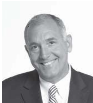
Fig. 60 Head tilt says in a powerful way, “I am comfortable, I am receptive, I am friendly.” It is very difficult to do this around people we don’t like.

the complete duration of the ride. For most people this is extremely difficult to accomplish, because head tilt is a behavior reserved for times when we are truly comfortable—and standing in an elevator surrounded by strangers is certainly not one of those times. Try tilting your head while looking directly at someone in the elevator. You will find that even more difficult, if not impossible.