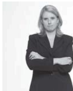
Fig. 34 Crossed arms with hands tightly gripping the arms is definitely an indication of discomfort.

It could be argued that women (or men) cross their arms simply because they are cold. But this does not negate the nonverbal meaning, since cold is a form of discomfort. People who are uncomfortable while being interviewed (e.g., suspects in criminal investigations, children in trouble with their parents, or an employee being questioned for improper conduct) often complain of feeling cold during the interview. Regardless of the reason, when we are distressed the limbic brain engages various systems of the body in preparation for the freeze/flight-or-fight survival response. One of the effects is that blood is channeled toward the large muscles of the limbs and away from the skin, in case those muscles will need to be used to escape or combat the threat. As blood is diverted to these vital