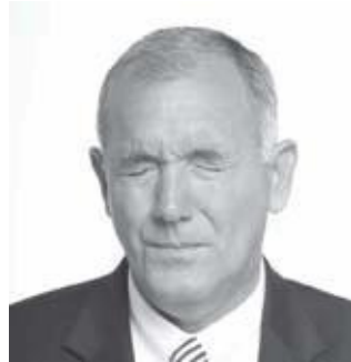
Fig. 67 Where the lids compress tightly as in this photo, the person is trying to block out totally some negative news or event.

Fig. 66 A delay in opening of the eyelids upon hearing information or a lengthy closure is indicative of negative emotions or displeasure.