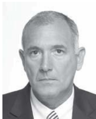
Fig. 76 When there is stress, the lips will begin to disappear and tighten.