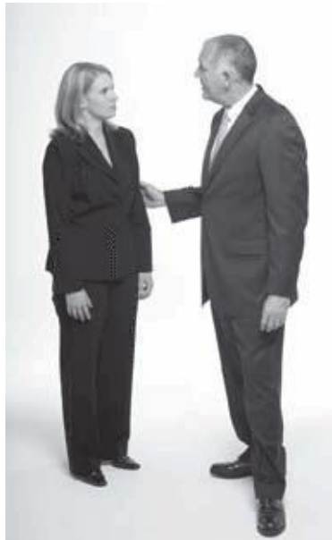
Fig. 18 Where one foot points and turns away during a conversation, this is a sign the person has to leave, precisely in that direction. This is an intention cue.

Recently I was with a client who had spent almost five hours with me. As we were parting for the evening, we reflected on what we had covered that day. Even though our conversation was very collegial, I noticed that my client was holding one leg at a right angle to his body, seemingly wanting to take off on its own. At that point I said, “You really do have to leave now, don’t you?” “Yes,” he admitted. “I am so sorry. I didn’t want to be rude but I have to call London and I only have five minutes!” Here was a case where my client’s language and most of his body revealed nothing but positive feelings. His feet, however, were the most honest communicators, and they clearly told me that as much as he wanted to stay, duty was calling.