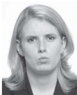
Fig. 79 We purse our lips or pucker them when we are in disagreement with something or someone, or we are thinking of a possible alternative.

Fig. 78 When the lips disappear and the corners of the mouth turn down, emotions and confidence are at a low point, while anxiety, stress, and concerns are running high.