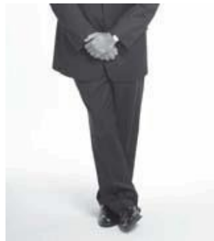
Fig. 22 We normally cross our legs when we feel comfortable. The sudden presence of someone we don't like will cause us to uncross our legs.

When I see two colleagues talking to each other and they both have their legs crossed, I know they are comfortable with each other. First, this shows a mirroring of behaviors between two individuals (a comfort sign known as isopraxism ) and second, because leg crossing is a high-comfort display (see figure 23). This leg-cross nonverbal can be used in interpersonal relationships to let the other person know that things are good between the two of you, so good, in fact, that you can afford to relax totally (limbically) around that individual. Leg crossing, then, becomes a great way to communicate a positive sentiment.