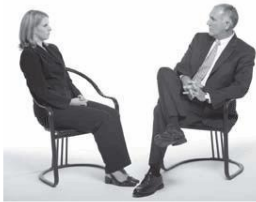
Fig. 24 In this photo the man has placed his right leg in such a way that the knee acts as a barrier between himself and the woman.