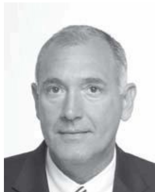
Fig. 73 This is a fake or “polite smile”: the corners of the mouth move toward the ears and there is little emotion in the eyes.

When we exhibit a social or false smile, the lip corner stretches sideways through the use of a muscle called the risorius . When used bilaterally, these effectively pull the corners of the mouth sideways but cannot lift them upward, as is the case with a true smile (see figure 73). Interestingly, babies several weeks old will already reserve the full zygomatic smile for their mothers and utilize the risorius smile for all others. If you are unhappy, it is unlikely that you will be able to smile fully using both the zygomaticus majoris and the orbicularis