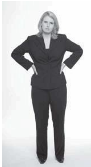
Fig. 42 In this photo the arms are akimbo, but note that the thumbs are forward. This is a more inquisitive, less authoritarian position than in the previous photo, where the thumbs are back in the “there are issues” position.

There is a variant to the traditional arms akimbo (which is usually performed with hands on hips with thumbs facing toward the back) in which the hands are