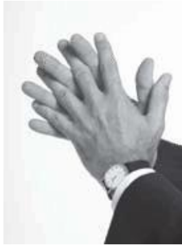
Fig. 58 When the fingers interlace to rub up and down, as in this photo, the brain is asking for extra hand contact to pacify more serious concerns or anxiety.