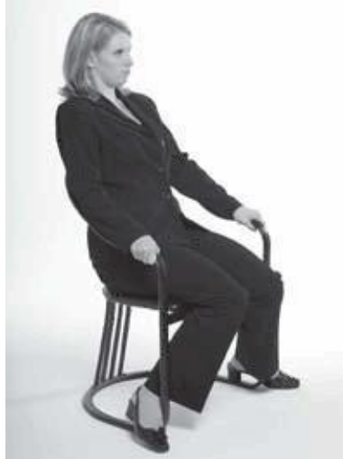
Fig. 29 The sudden locking of ankles around the legs of a chair is part of the freeze response and is indicative of discomfort, anxiety, or concern.