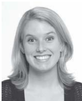
Fig. 70 Flashbulb eyes can be seen when we are excited to see