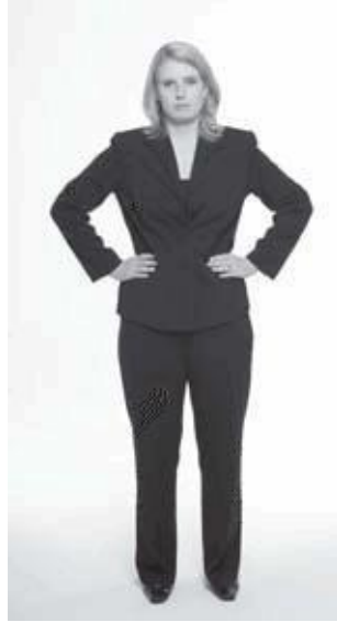
Fig. 41 Women tend to use arms akimbo less than men. Note the position of the thumbs in this photograph.