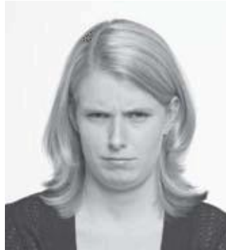
Fig. 63 Squinting can be very brief—1/8 of second—but in real time may reflect a negative thought or emotion.

whom she had previously had words. The low-hand wave was done out of social convention; however, the eye squint was an honest and betraying display of negative emotions and dislike (seven years in the making). My daughter was unaware that her squinting behavior had given away her true feelings about the girl, yet the information stood out like a beacon to me (see figure 63).