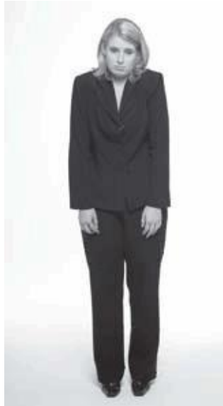
Fig. 38 Shoulders rising toward the ears causes the “turtle effect”; weakness, insecurity, and negative emotions are the message. Think of losing athletes walking back to the locker room.

This turtlelike behavior also shows up in families when the father says, “It really hurt my feelings to find that someone broke my reading lamp without telling me.” As the father looks at each of his children, one will be looking down, shoulders rising toward the ears. You will also see these weak shoulder displays demonstrated by a losing football team as they walk back to the locker-room—their shoulders seeming to swallow up their heads.