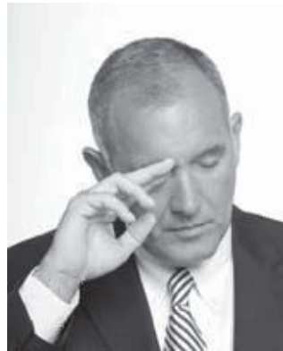
Fig. 65 A brief touch of the eyes during a conversation may give you a clue to a person’s negative perception of what is being discussed.