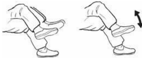
Fig. 27 When a foot suddenly begins to kick, it is usually a good indicator of discomfort. You see this with people being interviewed, as soon as a question is asked they do not like.

Leg twitching and movement is normal; some people do it all the time, others never. It is not indicative of lying—as some erroneously believe—as both honest and dishonest people will twitch and jiggle. The key factor to consider is at what point do these behaviors start or change. For instance, years ago Barbara Walters was interviewing Academy Awards nominee Kim Basinger prior to the awards ceremony. Throughout the interview, Ms. Basinger jiggled her feet and her hands seemed to be very nervous. When Ms. Walters began to ask Ms. Basinger about some financial difficulties and a questionable investment she and her then husband had made, Ms. Basinger's foot went from jiggling to kicking. It was instantaneous and remarkable. Again, this does not mean she was lying or even intended to lie in response to the question, but it was clearly a visceral reaction to a negative stimulus (the question asked) and it reflected her disdain for the inquiry.